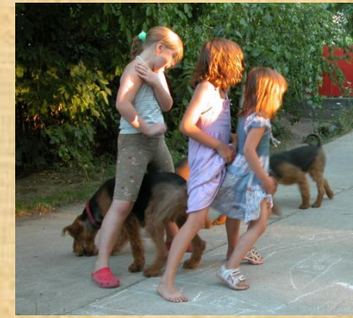
Sing and get through