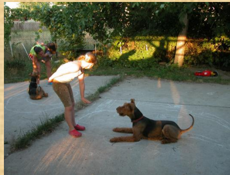
Low - Down