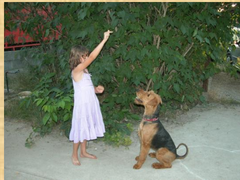
High - Sit